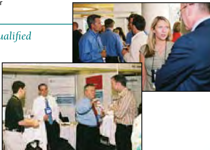
Exhibit space is limited so be sure to register for a preferred space today! The Exhibition Hall is designed to complement the session presentations that introduce the issues and concepts encountered with global stock plans. By exhibiting at the GEO conference, your company will be gaining the greatest exposure to the largest gathering of international equity compensation professionals!